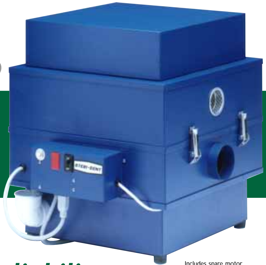
Includes spare motor

Steri-Vac is designed for affordability, reliability, and easy installation. Its waterless operation is highly economical.