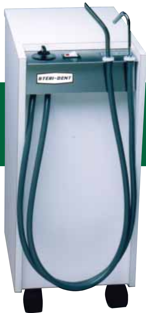
Includes two hoses and two mouthpieces. Shown with optional metal mouthpieces.

By-pass motor 7.5 Amps – 115V 60Hz. Also available in 220/230V.